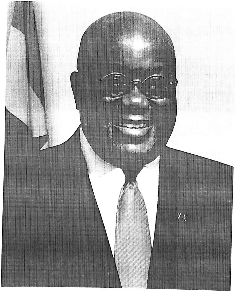
NANA ADDO DANKWA AKUFO-ADDO PRESIDENT OF THE REPUBLIC AND COMMANDER-IN-CHIEF OF THE GHANA ARMED FORCES